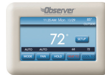
TSTAT0201CW (Order Separately)

* Applies to original purchaser/homeowner, some limitations may apply. See Warranty certificate for complete details.